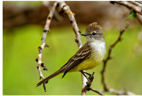
Left: Northern Screamer. Right: Northern Scrub-Flycatcher.

Other cool birds: Dwarf Cuckoo, Pied Puffbird, Stripe-backed Wren, Orange-crowned Oriole, Rufescent Tiger-heron, Straight-billed Woodcreeper, Red-rumped Woodpecker, Striated Heron, Cocoli Heron, Orange-chinned Parakeet, Yellow-chinned Spinetail, Rufous-browed Peppershrike, Purple Gallinule, Magnificent Frigatebird, Wood Stork, King Vulture, Hook-billed Kite, Snail Kite, Gray-lined Hawk, Common Black-hawk, one or more species of kingfishers – Ringed, Amazon, Green & American Pygmy Kingfisher.