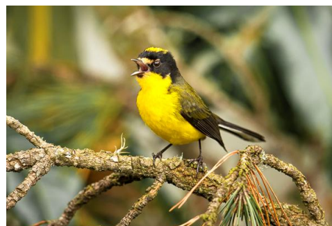
Left: Endemic Black-cheeked Mountain-tanager . Right: Endemic Yellow-crowned Redstart .

In these high-altitude environments, we also hold the thrilling potential to witness some of the most magnificent raptors: the majestic Andean Condor, the powerful Black-and-Chestnut Eagle, and the elusive Solitary Eagle.