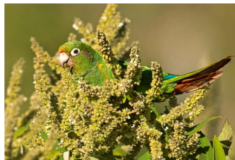
Above: Endemic Santa Marta Parakeet , photographed at Cuchilla de San Lorenzo.