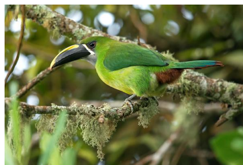
Left: Band-tailed Guan. Right: Southern Emerald (Santa Marta) Toucanet.

After dinner, the adventure continues! We will embark on a focused night search for the recently described (2018) Santa Marta Screech-Owl . This fascinating bird is a newly recognized endemic, yet an ancient inhabitant of these very forests.