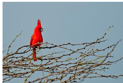
Left: Female Black-crested Antshrike . Right: Male Vermilion Cardinal (NE & VU).

Completing our expected sightings are several additional raptors: the impressive Crane Hawk, Savanna Hawk, Black-collared Hawk, Harris's Hawk, and the White-tailed Hawk.