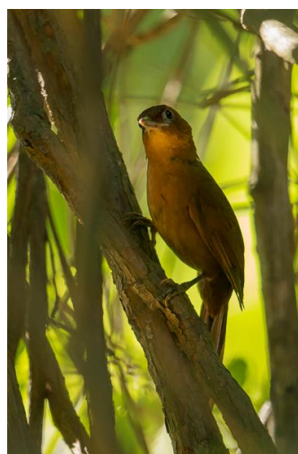
Left: Near-endemic Streak-capped Spinetail. Right: Endemic Santa Marta Foliage-gleaner.

After lunch, we begin our scenic drive north along the Caribbean coast and into the unique La Guajira Peninsula, arriving at the town of Camarones by the end of the day. Our base for exploring this distinct arid environment will be El Remanso del Santuario, a charming, small lodge situated right within the boundaries of the renowned Los Flamencos Wildlife Sanctuary.