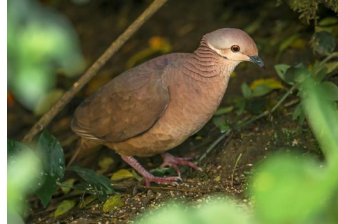
Left: White-tipped Quetzal (NE). Right: Lined Quail-dove.

We will dedicate the morning to seeking out the more challenging and elusive species in the forests immediately above and below the lodge. Our key targets could likely include the secretive Black-fronted Wood-Quail (NE & VU), the endemic Sierra Nevada Brushfinch , and the stunning White-tipped Quetzal .