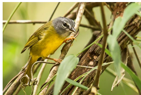
Left: Endemic Santa Marta Blossomcrown . Right: Endemic White-lored Warbler .