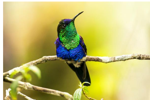
Left: Lazuline Sabrewing. Right: Crowned Woodnymph.